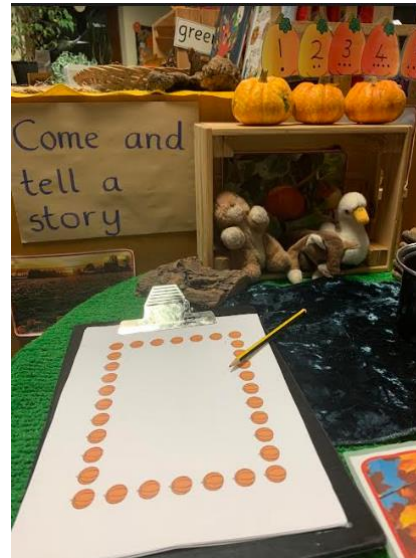
Come and tell a story