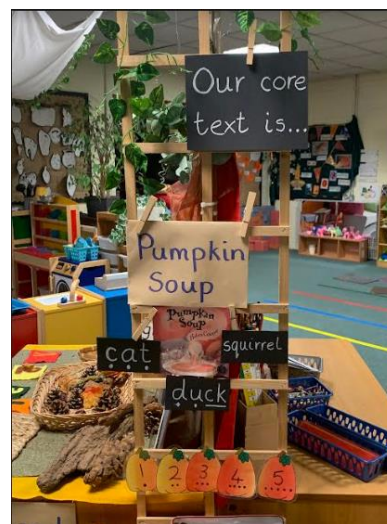
Our core text display

We talked about Remembrance and why we see people wearing poppies.